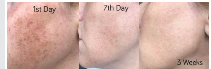
Above: Pigmentation Removal